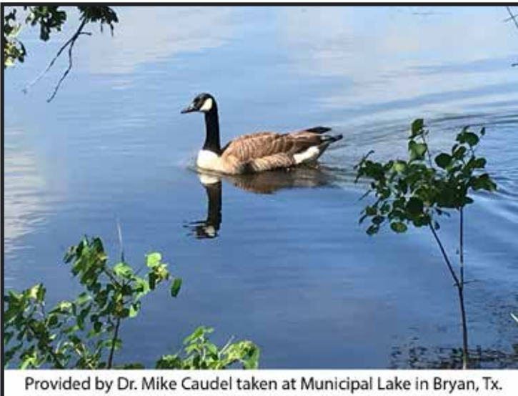
Provided by Dr. Mike Caudel taken at Municipal Lake in Bryan, Tx.

sleeping water lilies nestled on crystal clear springs gentle cascading rain drops catch earth's sunrise Whippoorwill's sweet song echoes willows weep dripping morning mist dark blue haze surrounds hidden ivy covered gray weathered wooden bridge Sunfish's rainbow jib slips thru foaming white lazy water Spring awakes.